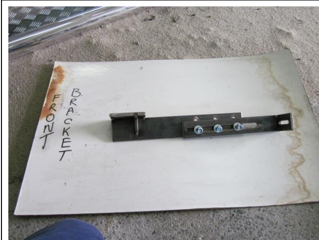
Front brackets left and right