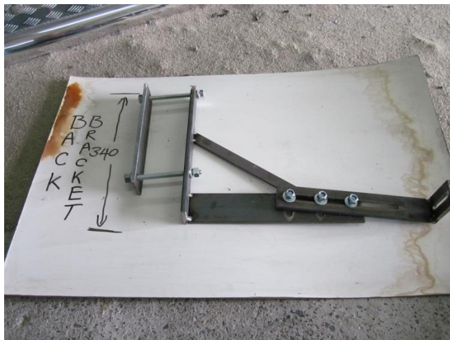
Back bracket left and right