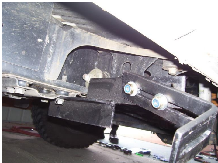
Front bracket –

Bolted to the back side of the gearbox cross mounting bracket