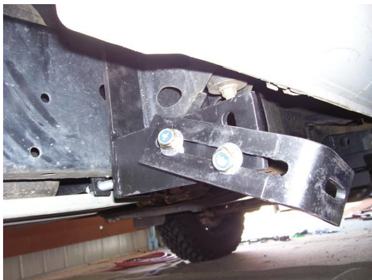
Rear bracket –

Bolted to the back side of the gearbox cross mounting bracket