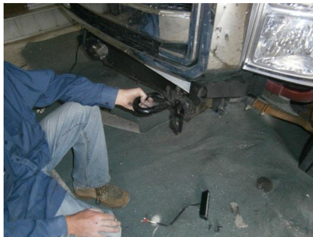
Remove tow eye bolts