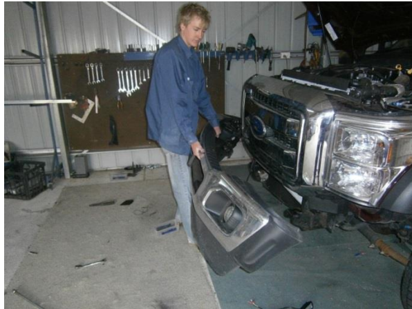
Remove front bumper